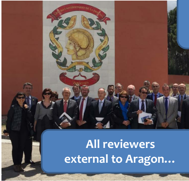
All reviewers external to Aragon...