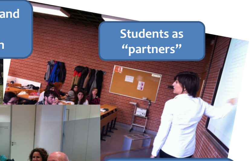
Students as "partners"